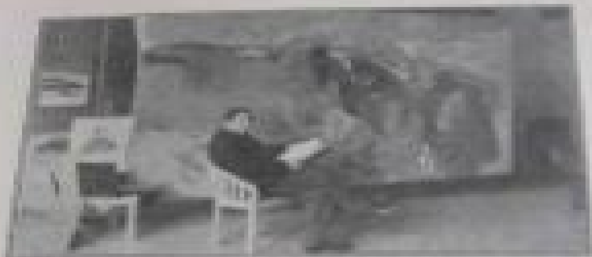
Portrait of a woman

Portrait of a woman —A portrait of a woman, painted by the artist, showing her in a room, looking at a large framed picture on the wall. The woman is wearing a dark jacket and light-colored pants. The room has a simple interior with a window and some furniture visible in the background.