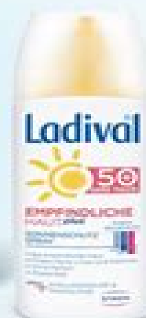
Sonnenspray 150 ml