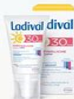
Sonnengel Gesicht 50 ml