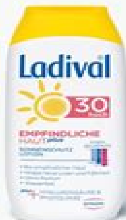
Sonnenlotion 200 ml