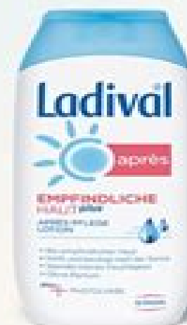
After Sun Gel 200 ml