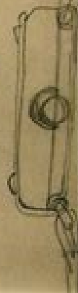
MILITARY WATCHES Original Watercolor 1982