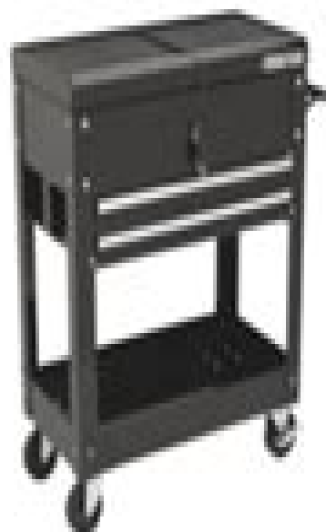
Ironton 28in. 2-Drawer Tool Cart, 30-1/2in.L x 14-1/2in.W x 33in.H, 350-Lb. Capacity