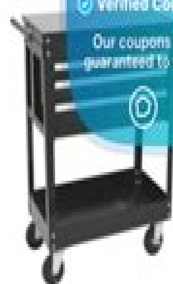
Ironton 30in. 4-Drawer Tool Cart, 33-7/8in.L x 17-5/8in.W x 39-1/8in.H, 500-Lb. Capacity