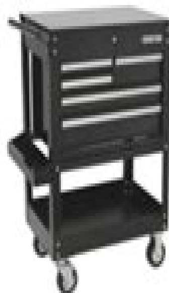
Ironton 30in. 5-Drawer Mechanic's Tool Cart, 33-7/8in.L x 17-5/8in.W x 39-1/8in.H, 700-Lb. Capacity